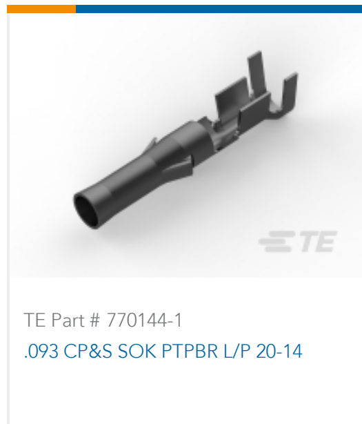
TE Part # 770144-1 .093 CP&S SOK PTPBR L/P 20-14