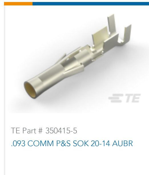
TE Part # 350415-5 .093 COMM P&S SOK 20-14 AUBR