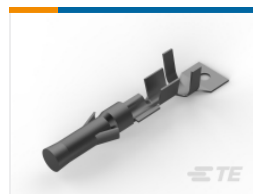
TE Part # 770529-1 .093 COMM P&S SOK 14-20 PTPBR