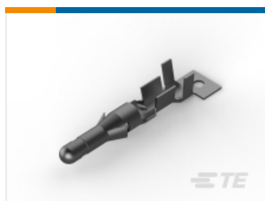
TE Part # 350416-1 .093 COMM P&S PIN 14-20 PTPBR