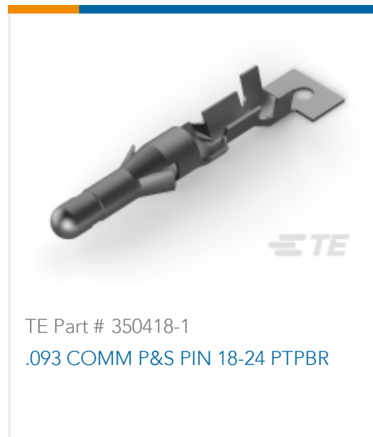
TE Part # 350418-1 .093 COMM P&S PIN 18-24 PTPBR