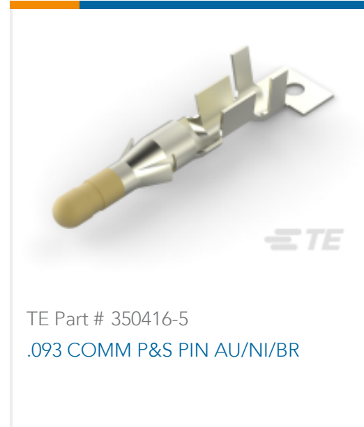
TE Part # 350416-5 .093 COMM P&S PIN AU/NI/BR