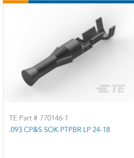
TE Part # 770146-1 .093 CP&S SOK PTPBR LP 24-18