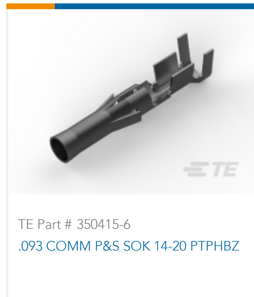
TE Part # 350415-6 .093 COMM P&S SOK 14-20 PTPHBZ