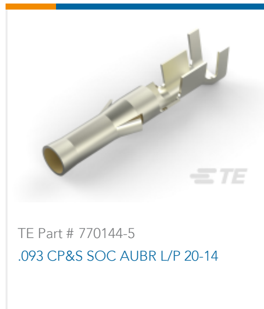
TE Part # 770144-5 .093 CP&S SOC AUBR L/P 20-14