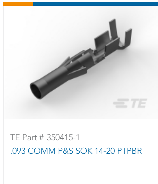
TE Part # 350415-1 .093 COMM P&S SOK 14-20 PTPBR