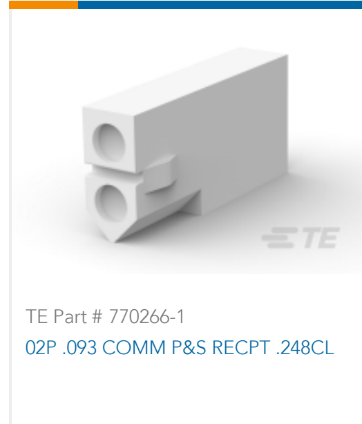
TE Part # 770266-1 02P .093 COMM P&S RECPT .248CL