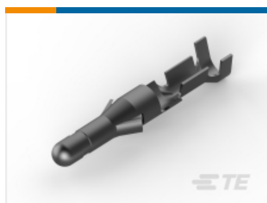
TE Part # 770147-1 .093 CP&S PIN PTPBR LP 24-18