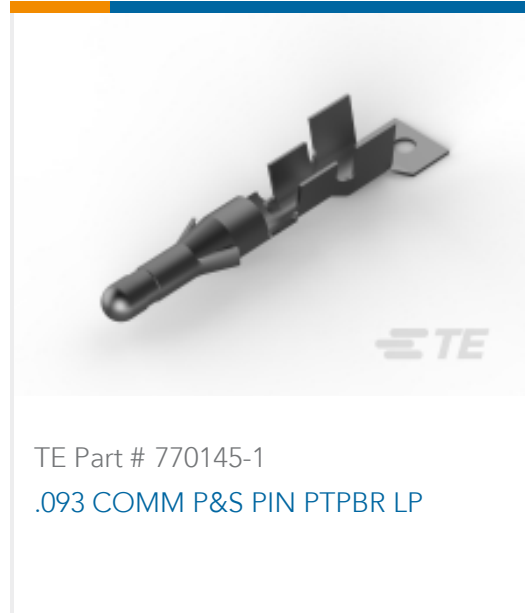
TE Part # 770145-1 .093 COMM P&S PIN PTPBR LP