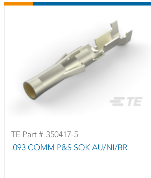
TE Part # 350417-5 .093 COMM P&S SOK AU/NI/BR