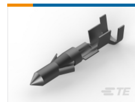
TE Part # 770530-1 .093 COMM P&S PIN 14-20 PTPBR