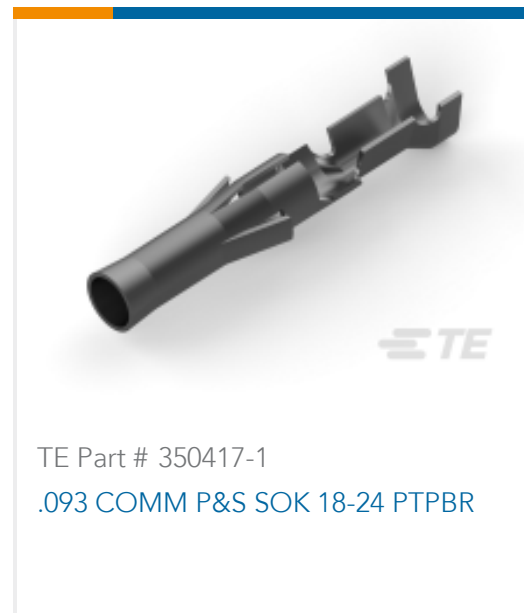
TE Part # 350417-1 .093 COMM P&S SOK 18-24 PTPBR