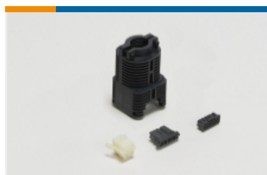
Rectangular Connector Housings(11)